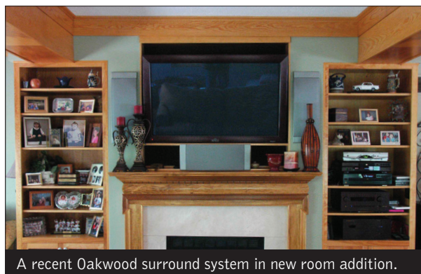
A recent Oakwood surround system in new room addition.

PHONE: 937.439.9373 • WEB: WWW.AV-DG.COM