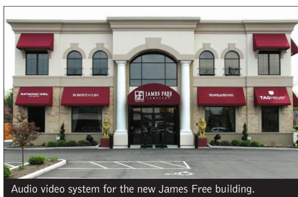
Audio video system for the new James Free building.